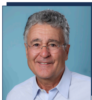
BY PATRICK A. GRASSO PRINCIPAL URBAN MINING INDUSTRIES

The diminishing supply of other Supplemental Cementitious Materials ("SCMs") used to reduce CO2 in concrete, such as fly ash and slag, is also driving the need to find alternatives. The availability of fly ash, the post-industrial byproduct of coal-burning plants, is declining as we continue to close or convert coal-burning plants to natural gas. The fly ash that is available is also of variable quality as suppliers reclaim and process previously land-filled ash. Slag is the byproduct of basic oxygen furnaces used in steel manufacturing and, as those plants move to more modern and efficient electric arc furnaces, the supply of usable slag is also declining. So, while the demand to reduce the carbon footprint of concrete is increasing, the two primary SCMs that have historically been used to achieve these goals are in diminishing supply.