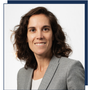
BY ANA GALLEGO PE

The revised PFIRMs were expected to go into effect in 2015 after review by an engineering team hired by the City of New York (the City). Instead, on June 26, 2015, the City filed an appeal stating that there were errors in FEMA's storm surge and offshore wave models that resulted in an overestimation of the 100-year storm floodplain and the height of the BFEs by more than 2 feet in some areas. This would have affected insurance premiums for thousands of structures.