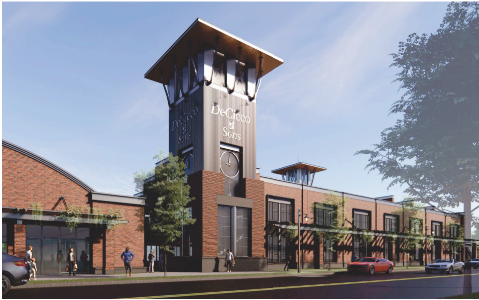
DeCicco & Sons Markets