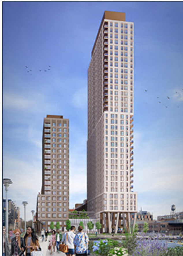
1 Jave Street rendering

circular economy: we harvest and process virtually 100% of our recycled glass, and use it in local, sustainable building projects, while also reducing transportation emissions and costly landfill space. It's good business done while being good environmental stewards!" Integrating recycled glass into various concrete-based materials not only diverts it from landfills but also reduces the need for virgin-mined materials, thus promoting an eco-friendly and resource-efficient approach to construction.