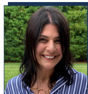
BY DENISE GRASSO PRINCIPAL URBAN MINING INDUSTRIES