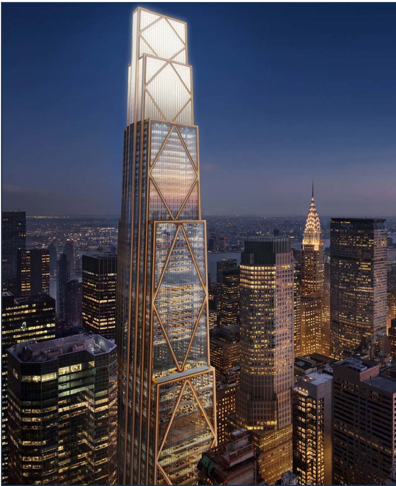
The 1,388-foot, 60-story skyscraper will be New York City's largest all-electric tower with net zero operational emissions. JPMorgan Chase New Global Headquarters Building New York City. Rendering by Foster + Partners

As a new, sustainable construction material, GGP offers an available, renewable, and higher performing alternative to the industry. While in commercial use now at 20-40% cement replacement levels, GGP can replace up to 50% of cement in concrete, reducing embodied CO 2 emissions from the cement they replace on a nearly ton-for-ton basis. Even higher replacements can be achieved when used in ternary blends. Because concrete is the most abundant construction material in the world, the potential beneficial environmental impact of using GGP in concrete is dramatic. Not only do GGP reduce harmful greenhouse gases, but they also produce a more durable, longer-lasting, and higher-performing concrete that significantly improves resistance to chloride penetration, sulfate attack, efflorescence, and freeze-thaw cycles. The consistently high percentage of silicon dioxide in bottle glass (+/- 71%) is what makes GGP a high-performance SCM. The hydration process of the cement in a concrete mix creates a number of compounds including Calcium Silicate Hydrate ("CSH") and Calcium Hydroxide ("CH"). The CSH is the binder that gives concrete strength, but the CH only weakens the concrete and causes porosity. What makes GGP impart such high-performance characteristics to the concrete is that the silica atoms from glass react with